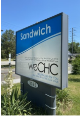
We have a new look!