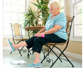
Bringing healthcare to you